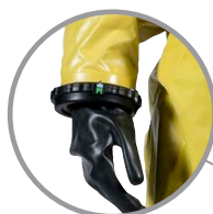
Bayonet glove ring system for quick and simple glove exchange