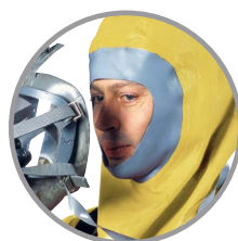
Anatomically designed face seal for optimum safety and comfort