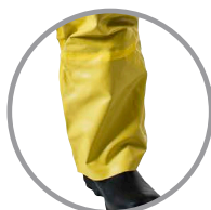
Attached boots or sewn-in socks in the suit material