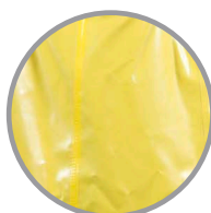
Highly chemical resistant, yet soft and flexible suit material with Viton® top coating